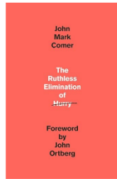
The Ruthless Elimination of Hurry John Mark Comer Amazon Link